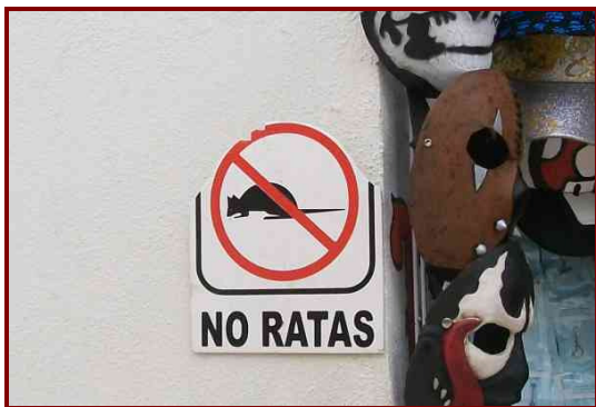
"No Rats," a sign in a shop in Uruapan. No rats allowed. But what about the rats that can't read?

For several months, Misael was unable to go there at all, because of the danger. While things have settled down somewhat, there is still trouble in the area, sometimes more, sometimes less. Recently the trouble has abated some more, but please pray that the situation will stabilize, so the Lord's work can continue there unhindered.