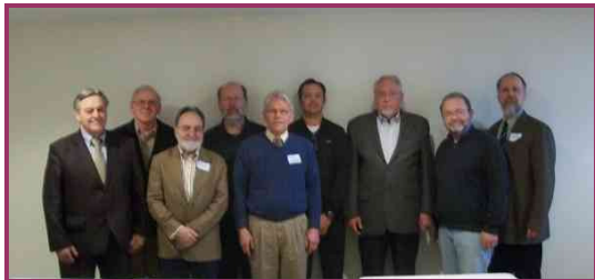
The board of Westminster Biblical Missions, meeting in April

The beam that shines from Zion's hill Shall lighten every land; The King who reigns in Salem's tow'rs Shall all the world command.