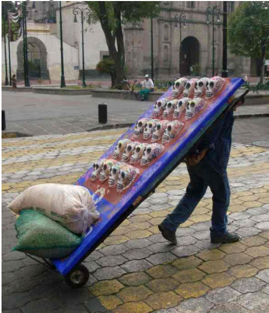
"Who can help me with this great burden?"

One image that seemed very poignant was of a man pulling along a large board filled with skulls, with his back bent under the load. It bore a striking resemblance to John Bunyan's Pilgrim, groaning under the weight of the great burden of his own sin. And then as now, the only place to be free of this terrible burden is at the foot of the cross of Christ. This is why we labor to take the authentic Gospel to the people of Mexico.