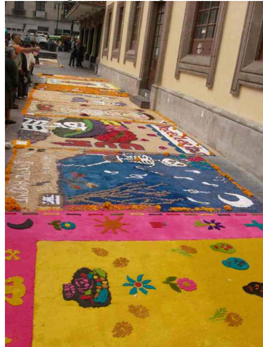
Some of the sidewalk art

simply be a memorial for departed loved-ones, for many the shrines and offerings are truly meant to summon back the spirits of the departed.