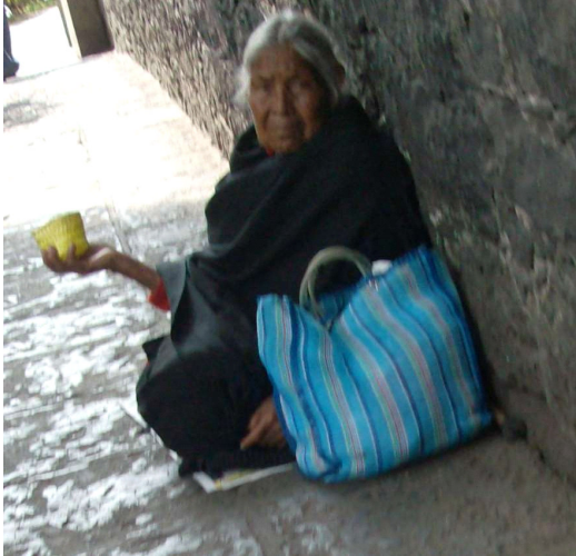
A very needy city in many ways!

the greater Mexico City area!), we are struck by how great and needy a field this is for the Gospel. Though quite modern in many ways, there still remain many firmly-entrenched remnants of an old pagan culture creatively wedded to a well-established age-old Romanism.