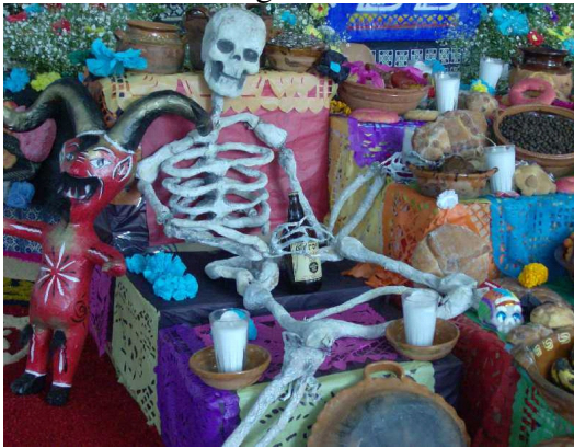
Part of an offering altar for a departed loved-one during the Day of the Dead.

the greater Mexico City area!), we are struck by how great and needy a field this is for the Gospel. Though quite modern in many ways, there still remain many firmly-entrenched remnants of an old pagan culture creatively wedded to a well-established age-old Romanism.